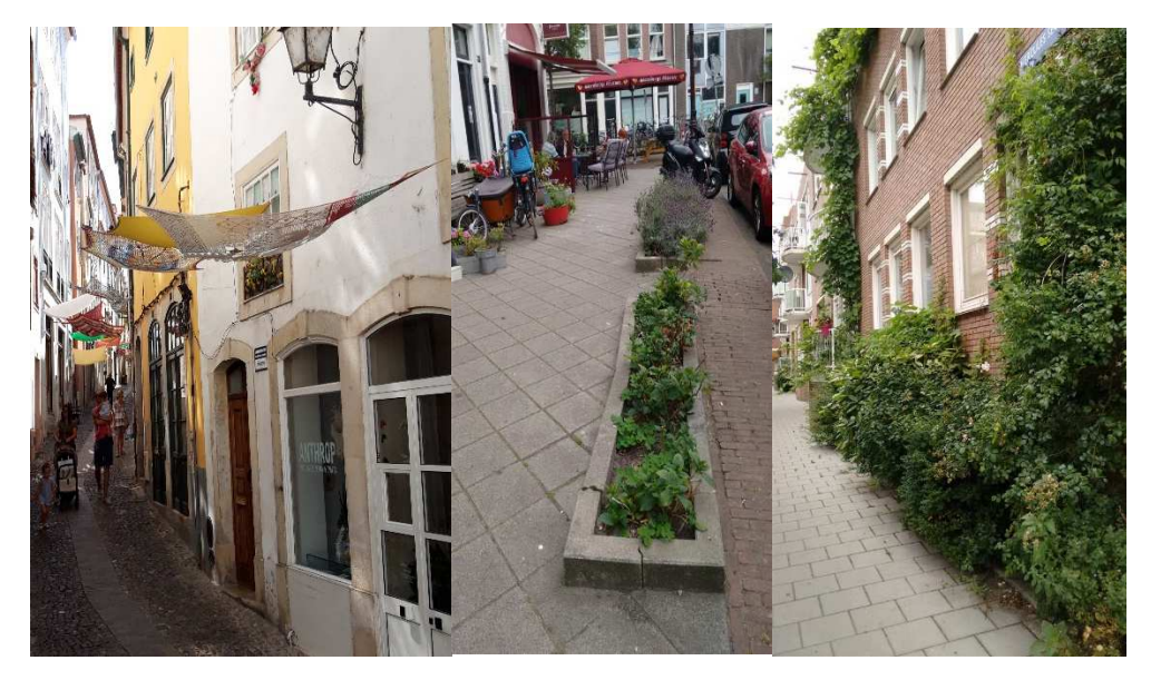
Figure 5 implemented measures to tackle climate change effect such as heat stress. Left: shading provided by cloth over shopping streets in Coimbra, Portugal. Right: stones removed from urban dense area of Amsterdam for lower temperatures and infiltration of stormwater